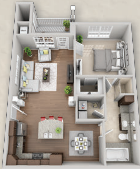
Richland 1 Bedroom 1 Bath 900 sq. ft.*