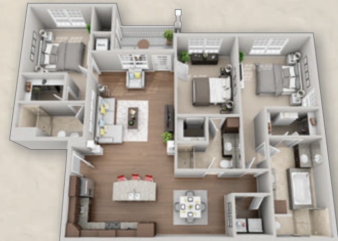
Bentley 3 Bedroom 3 Bath 1500 sq. ft.*