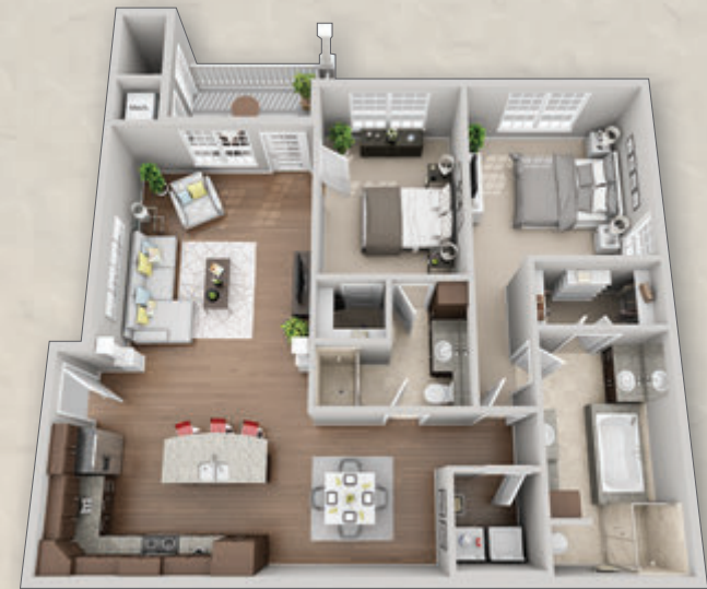
Kingston 2 Bedroom 2 Bath 1250 sq. ft.*