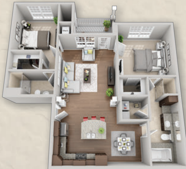
Harmony 2 Bedroom 2 Bath 1180 sq. ft.*